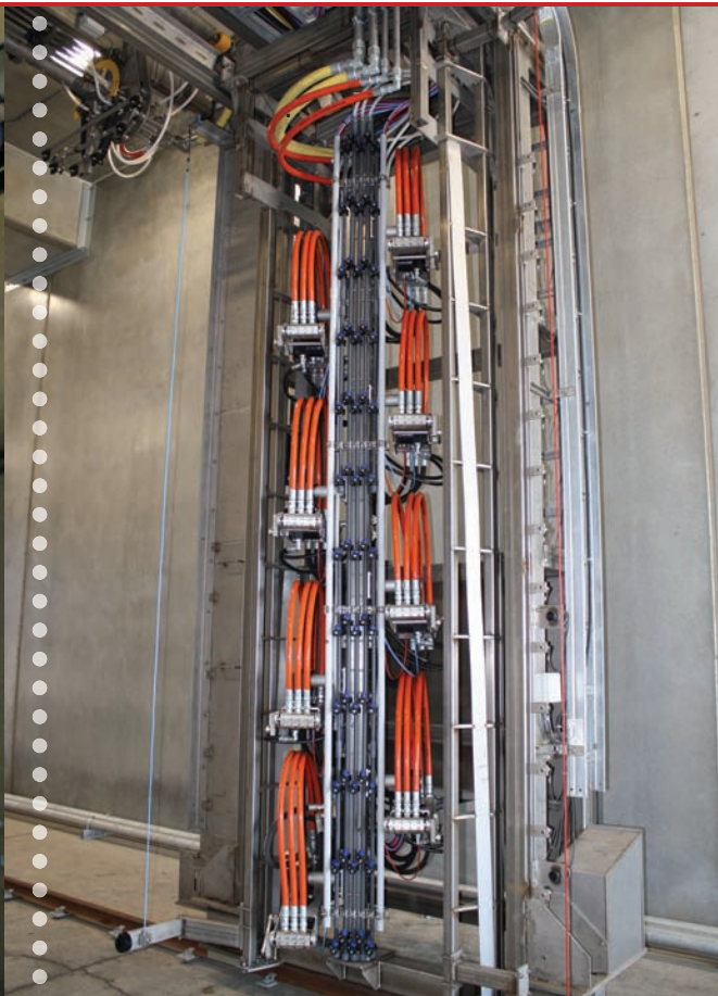
▼ The equipment for a two-bay truck wash.