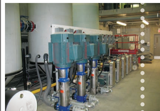
▼ Water treatment products.