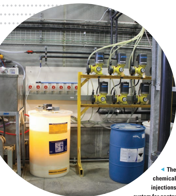
◀ The chemical injections system for gantry chemical application.

A tractor trailer is more than just a large piece of on-road equipment. It's a major investment, foundation to a livelihood and a home away from home. Collectively, big rigs are the engine that keeps industries and economies in motion.